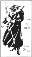
One of Moorcock's knights in full armor.

By the mid-1970s, the success of his full body of work was such as